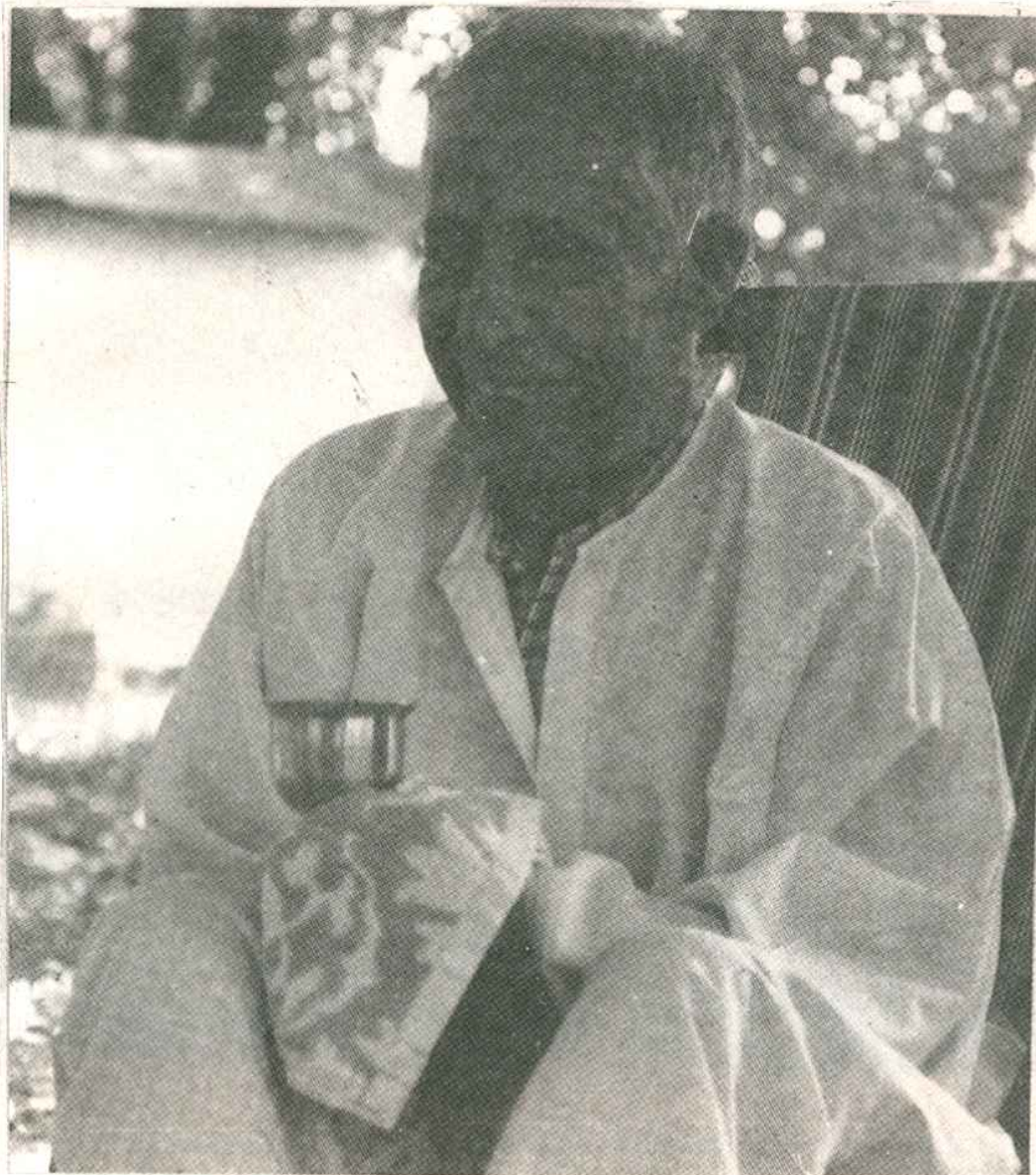
Swāmī Lakshman Joo during a Sunday class having Kashmiri tea 'kahwa' in a traditional Kashmiri cup 'khos'.