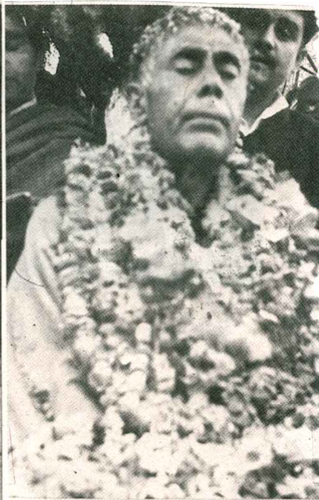
Swāmī Lakshman Joo in deep trance on his birthdays.