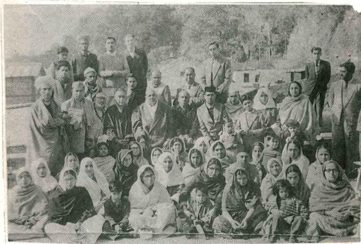
With Swāmi Śivānanda and disciples in Sivananda Ashram, Rishikesh, 1962.