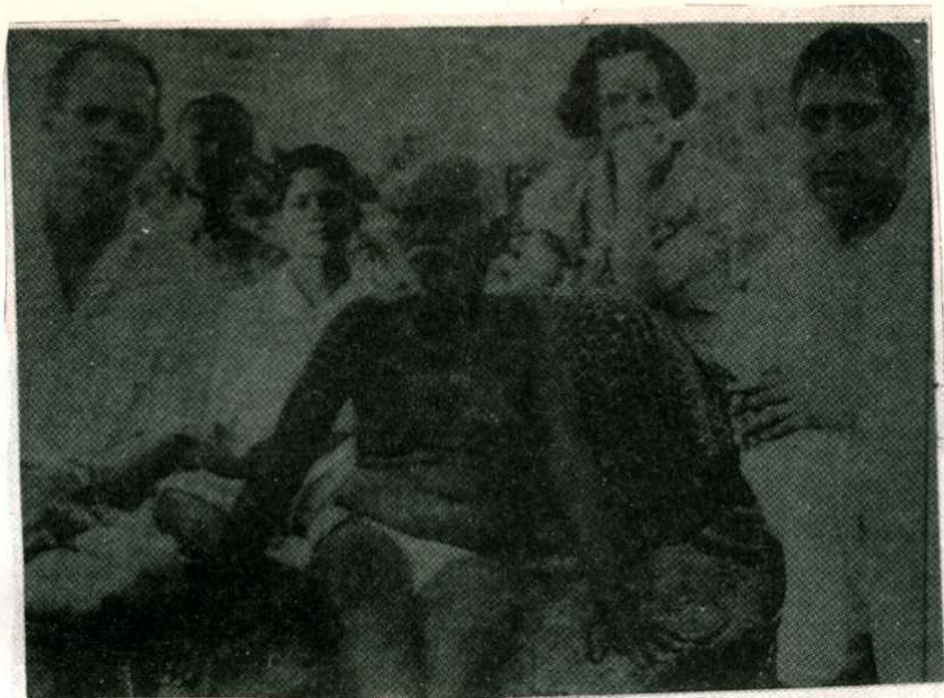
With Maharshi Ramana, 1938.