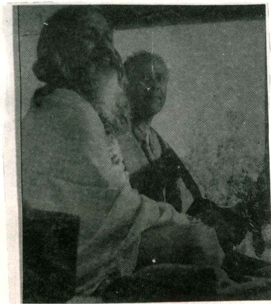
With Maharshi Mahesha Yogi, 1964.